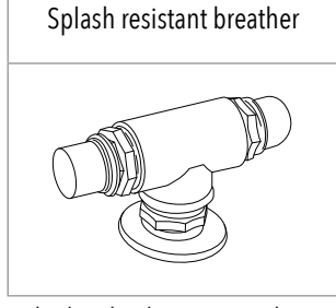
*Inclusions may change without notice, check with sales prior to ordering