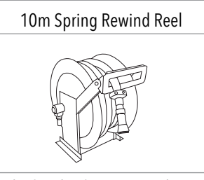
*Inclusions may change without notice, check with sales prior to ordering